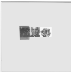
Simón Ramirez TQM 2021 Graphite on paper 14 x 14 inches