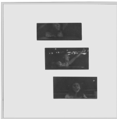
Simón Ramirez Untitled 2021 Graphite on paper 14 x 14 inches