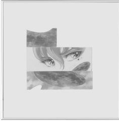
Simón Ramirez Luna 2021 Graphite on paper 14 x 14 inches