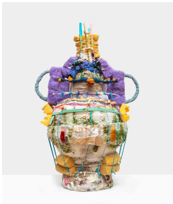
Amra Causevic "Data collector vessels series" 2023 paper, salt, moss, found objects 24 x 15 inches