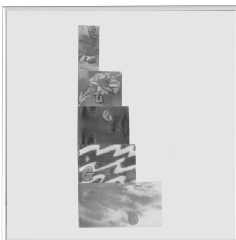
Simón Ramirez Fuego 2021 Graphite on paper 14 x 14 inches